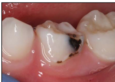
FIGURE 3 Three-year stabilization of a carious lesion on 1 primary molar after SDF application.