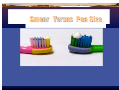
FIGURE 4 Diagram of smear versus pea-sized amount of fluoride toothpaste.

of the first tooth. A smear or grain of rice sized amount is recommended for children younger than 3 years, and a pea-sized amount of toothpaste is appropriate for most children starting at 3 years of age (see Fig 4).