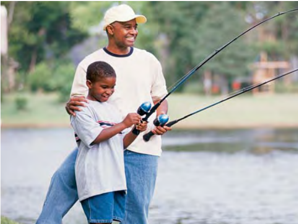
Fishing sinkers are one of the most common and readily accessible sources of lead exposure for older children and adults.