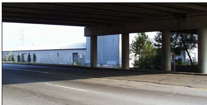
Former Zonolite/W.R. Grace Facility—St. Louis, Missouri Photograph taken from Manchester Road under the Hampton Avenue bridge looking southeast at the Former Zonolite Facility, 2002

Presently, workers at the facility and the community are not being exposed to asbestos from the site. The primary exposure pathways that