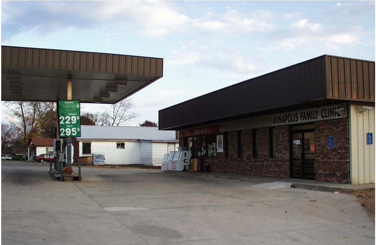
Figure 1. Photo of Sherrill Mini-Mart and Annapolis Family Clinic, Annapolis, MO