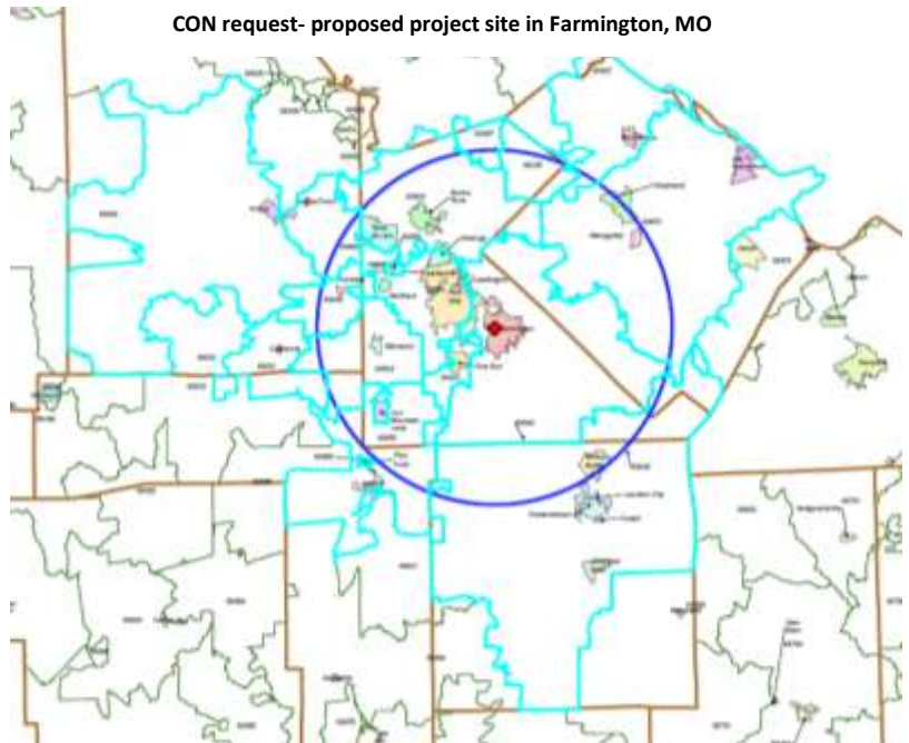
CON request- proposed project site in Farmington, MO

Knowing the projected pattern of change with population data helps the CON office predict future needs of a community and maintain a balance between the number of healthcare facilities in an area and the population that will become potential customers. If the number of healthcare facilities exceeded the population to be served, it could possibly result in healthcare inflation. This inflation may force hospitals or nursing homes to increase its service charges because it cannot fill its beds to keep up with its fixed costs.